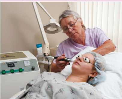
Laser skin treatment