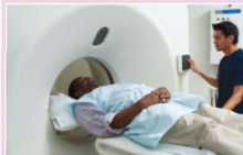
Patient undergoing a brain scan

Thanks to this comprehensive and ever-expanding range of general and specialist services at Eureka Medical Clinic and the Bougainvillea Clinic, the BVI's private healthcare sector continues to thrive. It is also perfectly geared to meet a wide variety of medical needs, be they residents or visitors to the islands.