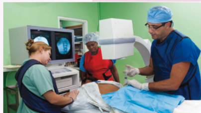
State-of-the-art operating theatre at the Bougainvillea Clinic, Road Town