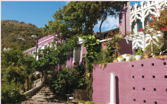
The Bougainvillea Clinic