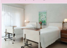
Patient's room at the Bougainvillea Clinic